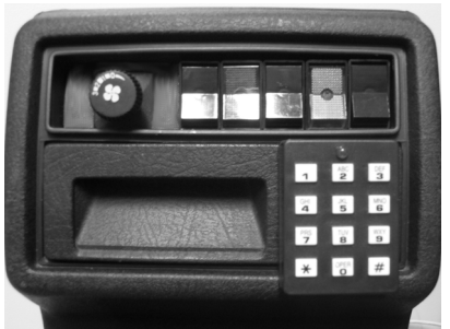
Fig.1. The dashboard controls

However, the controls differed from each other with their design. The rotary interface had four positions, made a clear clicking sound when rotated from a position to another, and the selected position was shown by a number at the top. The position of the rotary interface was also possible to remember and count from the number of clicks when rotated. The colour interface included a row of five similar two-position switches. Three switches were black and between them was a green and a blue switch which were the ones used in the tasks. The locations of the colour switches were possible to remember and feel without the use of visual attention by remembering that they were next