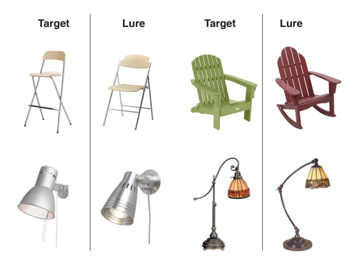
Figure 1: Example stimuli for Experiments 1 and 2. Targets were seen in the study phase. Both targets and lures were presented (independently) during the recognition test. Which items were targets and which lures was counterbalanced between participants.

Experiment 1 is a conceptual replication and extension of Luypan (2008), Experiment 4 (described above). We introduced a third study task which required participants to judge the orientation of the presented object (facing left or facing right). The orientation task has a number of properties that make it a desirable control for both the preference and category labeling task. First, unlike the preference judgement task, the orientation discrimination requires little processing of specific idiosyncratic features of the items. In addition, while orientation (left/right) may be seen as a type of categorization judgement, it is unlikely to activate the same kind of prototypical features as labeling an object according to its basic-level category. Orientations judgments should neither result in reduced memory performance caused by a representational shift nor improved performance caused by requiring attention detail. Therefore, it provides a good baseline to determine which of these two potential effects contribute to the pattern of results in the origi-