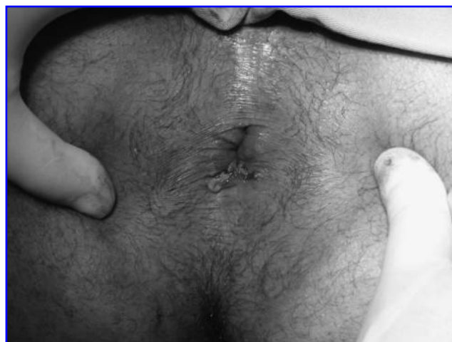
FIG. 4. Postoperative scar.

Scars occurred because of burn lesions in four patients. No other authors have reported this complication, but it is clear that experience leads to expertise. The more energy is