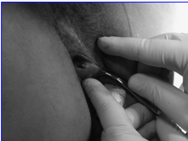
FIG. 1. Laser application inside the hemorrhoid.

Once the piles were identified, they were punctured and the laser energy (diode laser, Synus Laser Inc., São Paulo, Brazil) was delivered through an optic fiber of 600 \mu\text{m} (Fig. 1), emitting a wavelength of 810 nm, with nominal power of 5 W, frequency of 5 Hz, and energy fluence of 19 J/cm 2 , pulling the fiber gradually until the pile shrunk. Total amount of energy was 4 to 10 Joules.