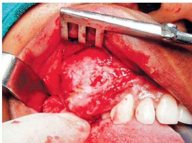
Fig. 3: Intraoperative photograph showing the bony lesion