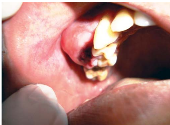
Fig. 1: Clinical intraoral photograph showing the lesion