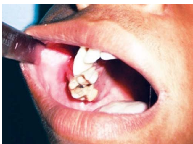
Fig. 4: Clinical intraoral photograph on follow-up

(Fig. 1), a bony hard swelling in upper gingiva was seen which had obliterated the gingivobuccal sulcus and extended from canine to second molar. The adjacent teeth were loose and displaced. Remaining head and neck and systemic examination was unremarkable. Computed tomographic (CT) scan (Fig. 2) showed a mixed density mass with diffuse scattered calcification involving the right maxillary alveolar ridge, occupying and expanding the maxillary sinus. The mass was well circumscribed and showed both radiolucent and radiopaque features. An intraoral biopsy was performed to confirm the type of lesion and the results of histopathological examination were consistent with aggressive COF. The patient was managed by surgical resection via an extended sublabial approach (Fig. 3) and tumor was removed in piece meal. The 0° endoscope was used for facilitating the complete removal of the tumor from the maxillary sinus. The excised surgical specimen reconfirmed the diagnosis of COF. The postoperative period was uneventful. There is no clinical sign of recurrence on