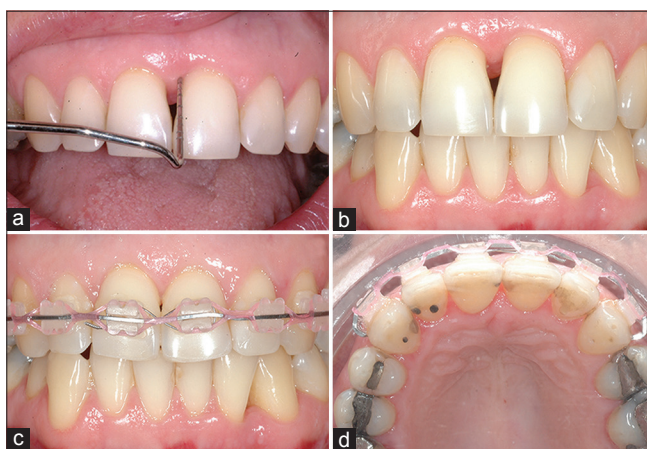
Figure 2: (a) 3 months after basic periodontal therapy with supra and subgingival scaling and root planning. The periodontal pocket was reduced about 7 mm but a black triangle was evident. (b) 3 months after basic periodontal therapy resulting in apical displacement of gingival margin leading to a compromised patient esthetics. (c and d) Initial orthodontic movement toward the intraosseous defect