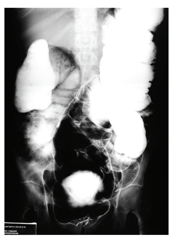
Figure 1. Enema demonstrating megarectum and megasigmoid.

A 58 year-old black woman with positive serology and medical record for Chagas disease reported history of intestinal constipation for 15 years, with many episodes of fecaloma. Thirty six months before, she complained of intermittent and painless enterorrhagia. She underwent enema, which showed megarectum and megasigmoid (Figure 1). Colonoscopy showed many polyps, and six were resected (Figure 2). The anatomopathological test (AP) showed intramucosal adenocarcinoma in one of the polyps,