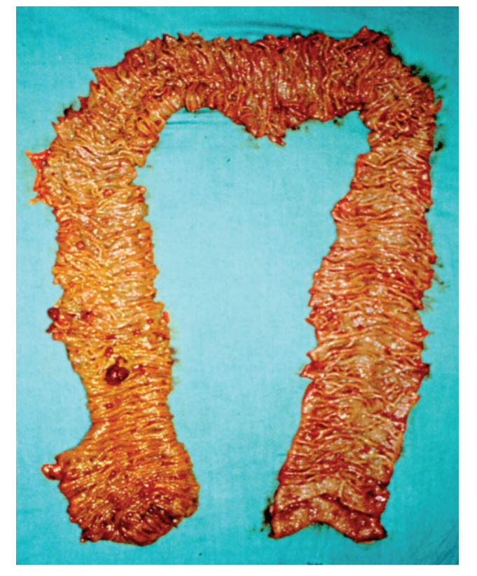
Figure 3. Surgical piece with megacolon and many polyps.