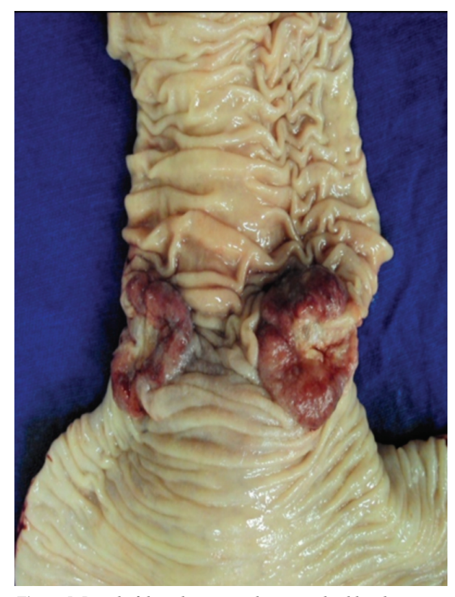
Figure 5. Detail of the colic tumor adjacent to the dilated segment.