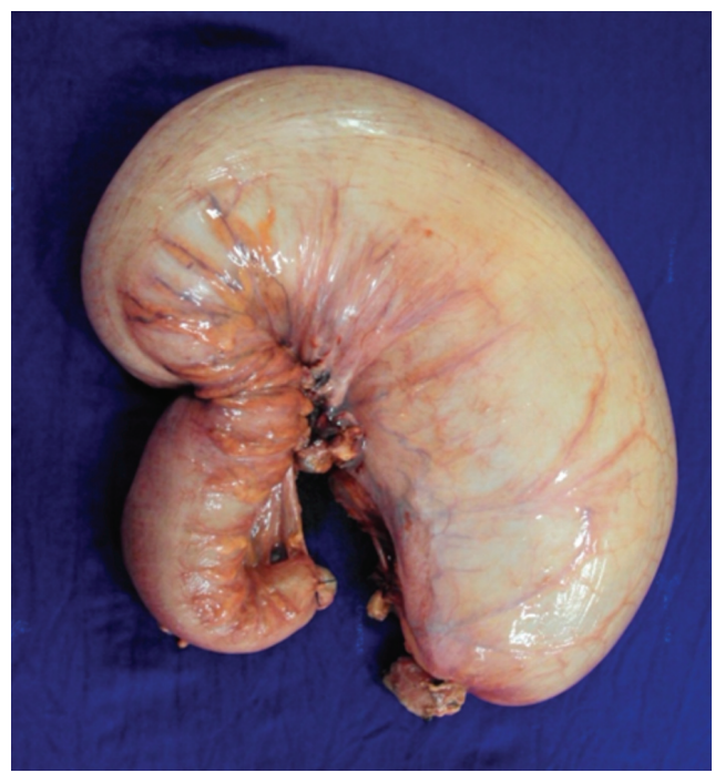
Figure 4. Surgical piece with megasigmoid.

Studies with necropsies and surgical specimens confirmed these findings. Meneses et al. <sup>16</sup> found only one case of colorectal cancer in 198 necropsies of patients with chagasic megacolon, and no cases in 129 surgical pieces from patients with chagasic colopathy. Garcia <sup>13</sup>, on the other hand, found one rectal adenocarcinoma out of the 802 studied surgical specimens.