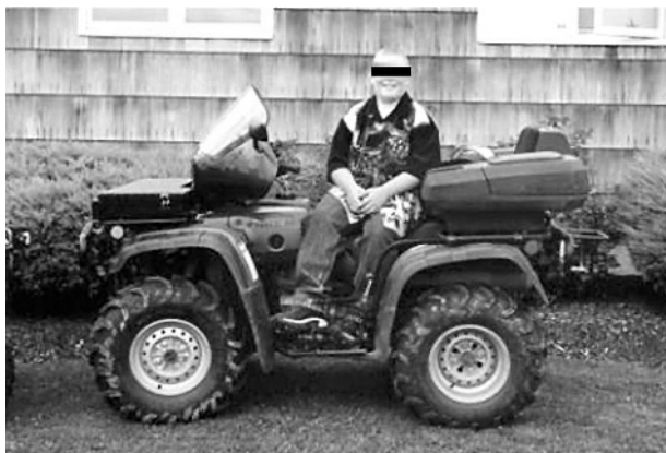
Figure 1 12 year old child on an all-terrain vehicle.

Spinal injuries, although uncommon, were significantly more frequent from ATV related incidents than bicycling, while bicycling and dirtbiking resulted in comparatively higher rates of upper extremity trauma. Compared to ATVs, bicycling resulted in 1.6-fold fewer deep soft tissue and bony injuries (fractures/dislocations), and 1.4-fold more “cuts and bruises”. The frequencies of trunkal, internal organ, and multisystem trauma were similar between ATV and MVC