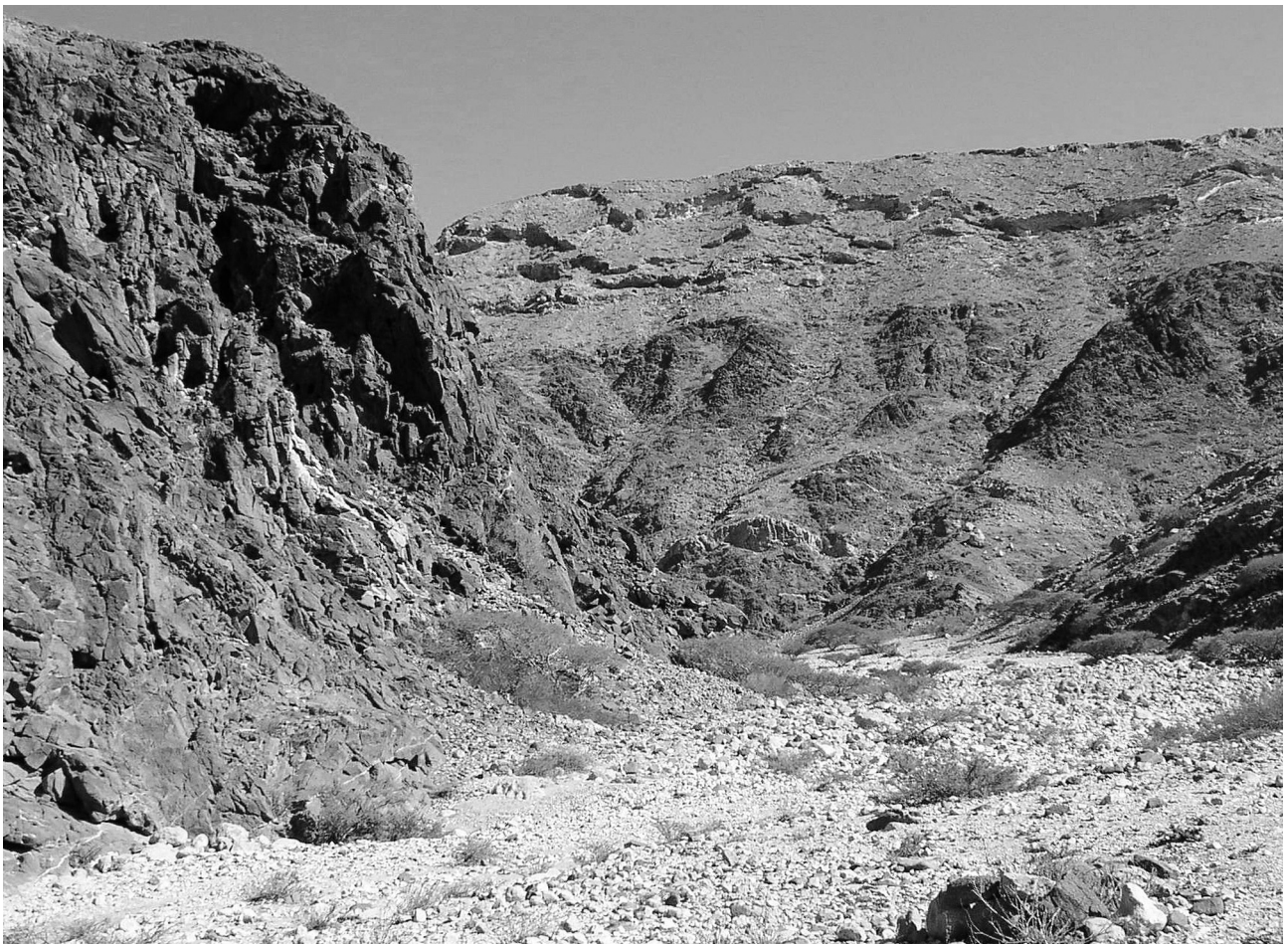
Fig. 3 - Habitat of Polygala moggii near Hasik (eastern Dhofar).