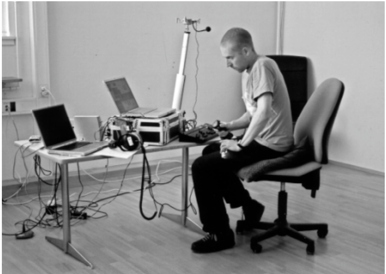
Figure 2. The Spectral Tourist in action. The Gravis Xterminator Dual Control requires two hands to control it properly, which is more involving in performance.

My joystick of choice is a Gravis Xterminator Dual Control [Fig. 2] which can sit on my lap or a desk and requires two hands to steady it. This helps it to feel instrumental and under control: it also requires full concentration. The act of trying to find, hold and move to satisfying sound spaces helps to avoid some of the common issues of performance with computers. The audience can see a struggle to get the sound to come out right, they hear the computer resist and the traditional relationship between analogue sound and intention is referenced.