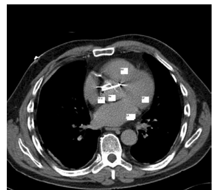
Figure 3. Computed tomography thorax shows TPW crossing ascending Ao into LV. Dark arrow points to temporary pacing wire. LA, left atrium, RV, right ventricle; TPW, temporary pacing wire; Ao, aorta; LV, left ventricle.