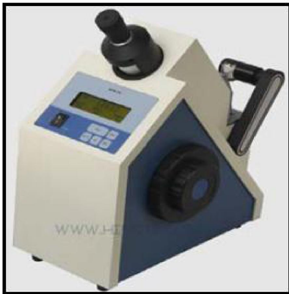
Figure 1: The way - 2s ABBE digital refractometer

The measurement range of the device extends from 1.3000 - 1.7000 with accuracy equals to \pm 0.0002 .