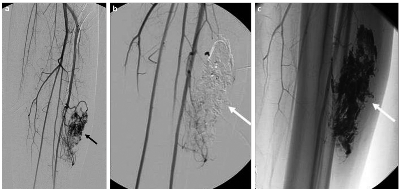
Figure 1. a–c. A 20-year-old woman with a left lower extremity high-flow vascular malformation. The diagnostic angiogram (a) demonstrates a high-flow vascular malformation mainly fed by the left anterior tibial artery (black arrow). Control digital subtraction (b) and inverted native (c) angiograms after NBCA embolization by the direct puncture route demonstrate complete obliteration of the vascular malformation lesion (white arrows). The patient underwent a surgical excision without complication.

Overall, for the embolization and sclerotherapy procedures, the technical success rate was 100%, whereas the clinical success rate (improvement in any of the initial symptoms: pain, loss of function, cosmetic concern or a successful/uneventful eventual surgical resection/curettage) was 100% in both the surgery and the non-surgery groups. As for complications, skin ulceration was observed in 4 patients who underwent sclerotherapy without subsequent surgical resection, and 2 of these patients underwent successful surgery for these skin ulcerations, whereas 2 recovered without any requirement for intervention. One patient, who had combined