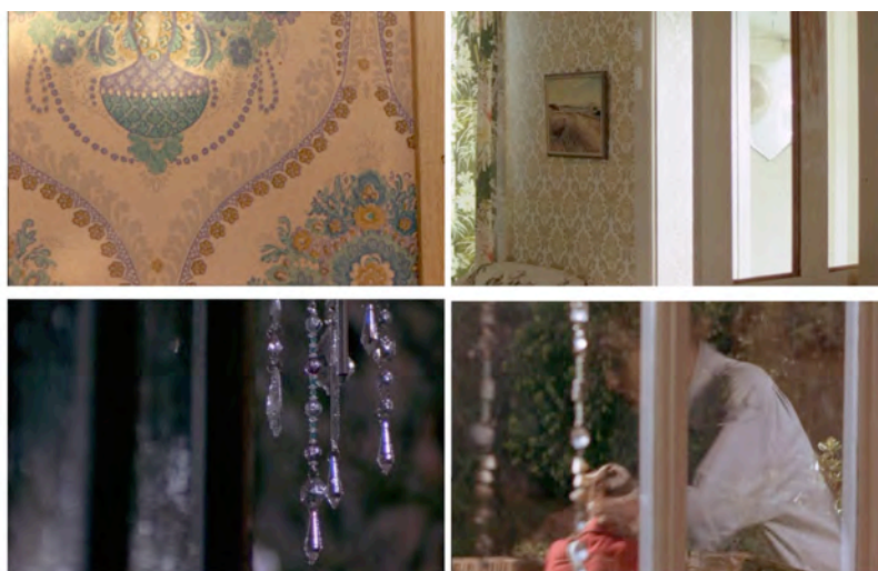
Figure 6: The Caterpillar Wish: inter-face