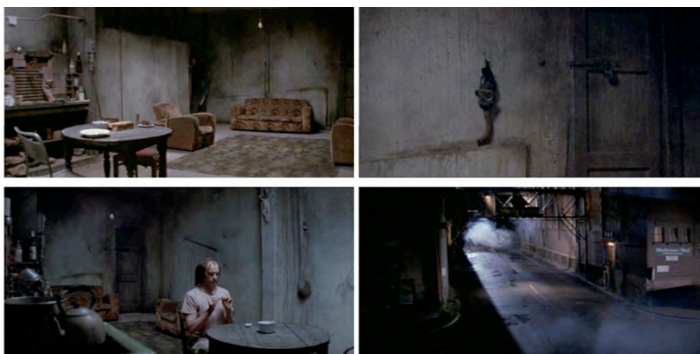
Figure 3: Bad Boy Bubby: beneath-ground