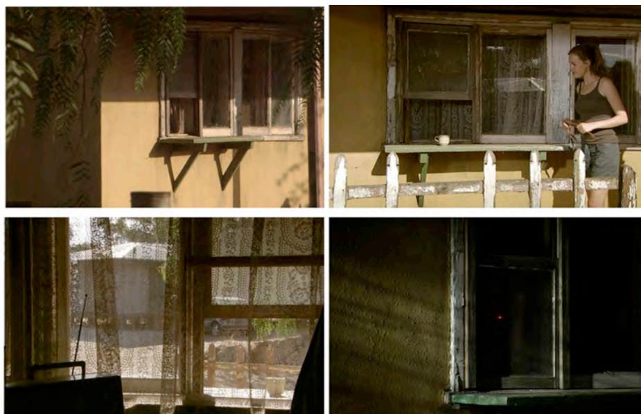
Figure 5: Rainshadow: crossing space