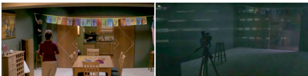
Figure 1: Alexandra's Project: thresh-hold – every-day

Anonymity is reinforced at the destination; a continuous façade in a line of identical 90's townhouses arranged around a grassed and barely landscaped park. Two arched porticos suggest the way inside. A clue to which inside is home in the presence of a mechanical shutter - presumably shielding those within from the glare outside the living room - and three potted ficus . This doubling condition, one of faintly curious identity in this bland suburb, is a clue to what lies within the future interior, but for now this is barely obvious.