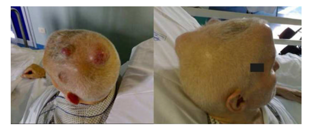
Figure 1. Skull lesions imaging. Presence of skull tumors over the right frontal and parieto-occipital regions.