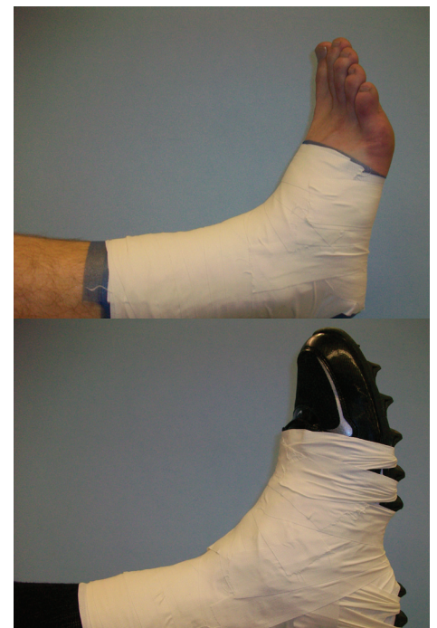
Figure 2: Ankle taping (top) and ankle spating (bottom) techniques.

After completing each drill, time-to-completion and heart rate were recorded. Accuracy measures (number of correct contacts and number of misses) were also recorded for the cutting drill. Subjects were presented with two separate 10-cm visual analogue scales after each drill for perception of comfort and stability. Each scale consisted of a 10-cm line anchored with two directives on either end. For the comfort scale, the anchor phrases were "least comfortable imaginable," [sic] and "most comfortable imaginable," [sic] whereas for the stability