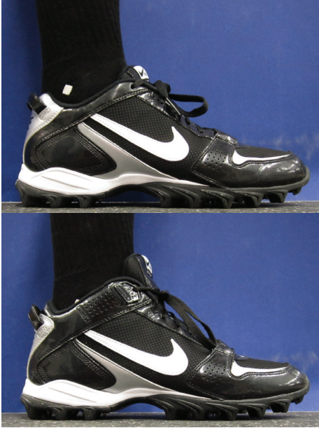
Figure 1: Subject wearing low-top cleat (top) and mid-top cleat (bottom). The white tape mark indicates the ankle lateral malleolus.

percentage = 12.3 \pm 0.9\% , resting heart rate = 66.4 \pm 4.1 beats per minute (bpm). For comparison to the football shoes used in the study, subjects were asked to bring their normal training shoes. The average mass of the subjects' training shoes was 364.6 \pm 9.9 g. ROM was determined using a standard 12" goniometer (HPMS Inc.) with all measurements taken at rest and on the right ankle. The four measurements taken were dorsiflexion, plantarflexion, talar eversion, and talar inversion.