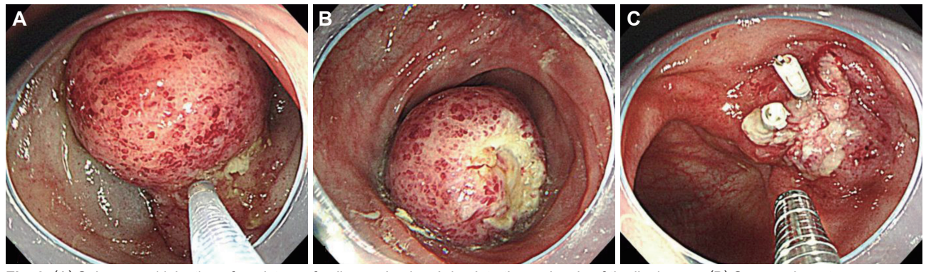
Fig. 3. (A) Submucosal injection of a mixture of saline and epinephrine into the peduncle of the ileal mass. (B) Snare polypectomy was performed by cap-assisted colonoscopy technique. (C) Hemoclipping at the base of the resected portion of the ileum to prevent delayed hemorrhage and perforation.

considering potential sequelae of ileal resection. In order to perform endoscopic procedure in the spacious colonic lumen, we tried to retract the mass into the colonic lumen through the ICV but unfortunately failed. Therefore, to keep a clear visual field within the narrow lumen of the ileum, a cap-assisted colonoscopy technique was used. After submucosal injection into the base of the mass, a snare polypectomy was performed within the ileum (Fig. 3A, B). And then, three clips were placed to prevent delayed hemorrhage or perforation (Fig. 3C). There were no immediate complications after the polypectomy. The histopathology report confirmed a 2.6 \times 2.7 cm subepithelial lipoma. At 2 days of fasting after the procedure, oral intake was started and the patient complained of no symptoms related to food intake. Since resection of the lipoma, her body weight has gradually restored.