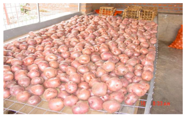
example of (Kinigi variety) washed potatoes from Gataraga IP, 2010

Scrubbing: This is the use of hands to remove the soil on the tubers of Irish potatoes without washing them. Scrubbed potatoes can be stored for longer time (Approximately 3 months), this production thus prepared is supplied to restaurants, hotels and food processors.