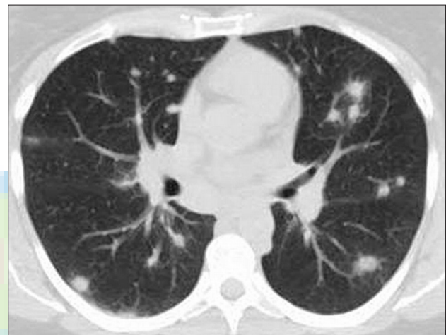
Figure 2: Chest computed tomography was consistent with multiple pulmonary nodules and pleural effusion