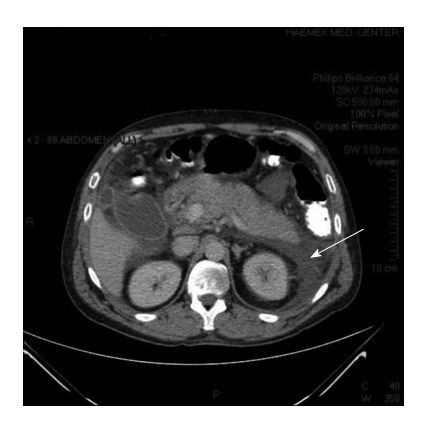
Figure 1 Abdominal computed tomography of the patient showing pancreatic edema and peripancreatic and pararenal fluid (arrow).

The results of the patient's laboratory examination indicated a hemoglobin level of 14.5 g/dL (normal level: 14-18 g/dL), which decreased to 7.7 g/dL; a leukocyte count of 13.6-17.8 k/ \mu L (normal level: 4.8-10.8 k/ \mu L); a platelet count of 200 k/µL (normal level: 130-400 k/ μL); a serum haptoglobin level of 128 mg/dL (normal level: 30-200 mg/dL); a reticulocyte count of 4% (normal level: 0.5-1.5%); reticulocyte production index 1.7 (normal index: 1); a serum amylase level of 2800 U/L (normal level: 28-100 U/L); a serum glutamic-oxaloacetic transaminase level of 196 U/L (normal level: 0-35 U/L); and a glutamate pyruvate transaminase level of 78-150 U/L (normal level: 0-45 U/L). His results also demonstrated a serum alkaline phosphatase level of 312-812 U/L (normal level: 30-120 U/L), a total serum bilirubin level of 15.3-23.6 mg/dL (normal level: 0.3-1.2 mg/dL), a direct bilirubin of 7.2-17.0 mg/dL (normal level: 0-0.3 mg/dL), a serum C-reactive protein level of 170 mg/L (normal level: 0-5 mg/L), an erythrocyte sedimentation rate of 96 mm/h (normal level: 0-15 mm/h), a serum albumin level of 2.36 g/dL (normal level: 3.5-5.2 g/dL), a serum uric acid level of 1.5 mg/dL (normal level: 3.5-7.2 mg/dL), and a serum lactate dehydrogenase level that was within normal limits. The patient's creatinine level at admission was 0.84 mg/dL (normal level: 0.67-1.17 mg/dL), and a blood film indicated anisocytosis and abnormal red blood cells. However, Heinz bodies were not