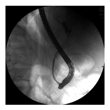
Figure 2 Endoscopic retrograde cholangiopancreatography of the patient showing removal of the stones by using a basket.

his 24-h copper excretion level was 305 \mu g (normal level: < 60 \mu g/24 h), which increased to 658 \mu g after trientine therapy was initiated. A liver biopsy showed chronic intrahepatic cholestasis, interface hepatitis, portal space lymphocytic plasma cells, and granulocyte infiltration (Figure 3); the hepatic copper content in the biopsy specimen was 304 \mu g/g (normal level: 10-35 \mu g/g) dry weight. In addition, a molecular genetic analysis of a blood sample revealed a V1140A homozygous mutation in the ATP7B gene. Considering these results, a diagnosis of Wilson's disease was established.