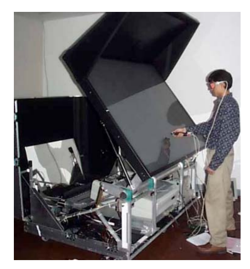
Figure 1: The ImmersaDesk-2.

A number of autostereoscopic displays have recently emerged on the market to take advantage of the low cost of LCD monitors (e.g. StereoGraphics' SynthaGram, Sharp LL-151-3D, SeeReal). While these displays are suitable for viewing stereoscopic images, they are not well suited for viewing viewer-centered stereoscopic images because they require that the viewer keep their head stationary and straight in order to see the correct pairs of vertically interleaved images. Furthermore, even though many of these displays boasted a resolution of 1600x1200, the interleaving techniques used to create the stereo effect meant that each eye's image had only a maximum resolution of 800x1200.