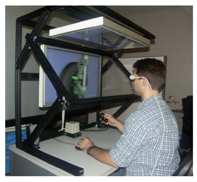
Figure 5: The Final Fully Constructed ImmersaDesk-4.