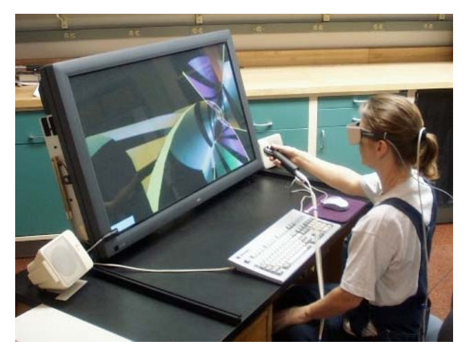
Figure 2: The ImmersaDesk-3.

uncompromised 4 mega-pixels (2560x1600) of resolution for each eye, and allows the user to comfortably move, tilt and turn their head while maintaining correct viewer-centered stereo with a wide field of view. The IDesk-4 achieves stereo using two 30" Apple Cinema Displays bisected by a half-silvered mirror to reverse the polarization of the polarized light emerging from one of the LCD screens. The viewer then wears polarized glasses to resolve the stereo images. An electromagnetic tracking system is used to track the orientation and position of the viewer's head to properly render the correct viewer-centered perspective images. An additional 3D pointing device (such as a Wanda or SpaceGrip) enables 3-space interaction.