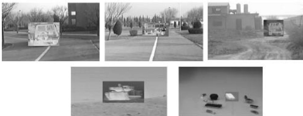
Figure 3: various targets detected using the detection algorithm.