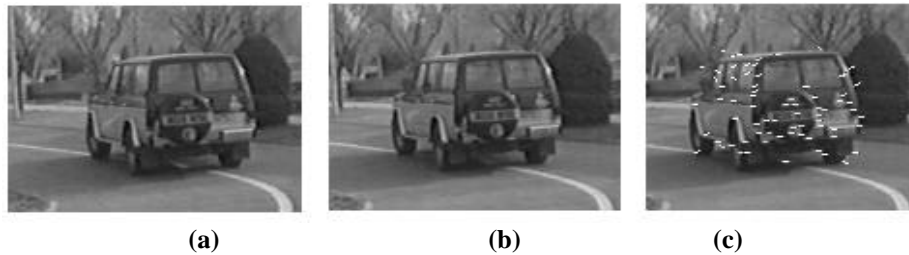
Figure 2: The refined disparity vector used for tracking. (a) Previous frame, (b) Current frame and (c) Current frame with disparity vectors

Results showed the accuracy of the method in detecting and tracking of moving objects. Comparison of results generated by the proposed method with those of other methods showed that more reliable results could be obtained using the proposed method in real-time.