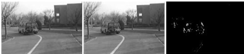
Figure 1: two consecutive frames and difference of them after background motion compensation, the calculated affine parameters are: a_1=0.9973 , a_2=-0.004 , a_3=0.008 , a_4=1.0022 , a_5=1.23 , a_6=-2.51

other hand when the target is detected it is not restricted to keep moving in tracking mode. The target can also be larger than 50% of the scenery in the tracking mode and this means camera can zoom to have a larger view of the target while tracking.